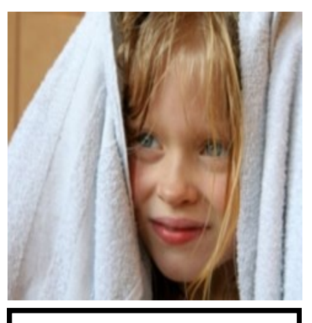
Anyone can get head lice!